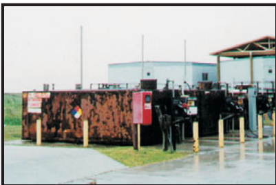
Steel Jacketed Tank In Costal Environment

Steel jacketed tanks require constant maintenance including sandblasting and repainting to prevent rust and corrosion. ConVault tanks are covered with a low maintenance concrete exterior in exposed aggregate, painted epoxy, Thorocoat or Sto™ finish that will not rust or corrode. ConVault owners can realize valuable time savings as well as saving thousands in maintenance.