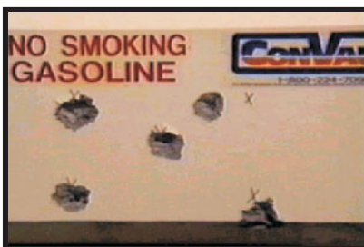
ConVault Ballistics Test

The six inches of reinforced concrete surrounding ConVault tanks gives owners added security by providing ballistic and impact protection for BOTH the primary and secondary containment. Secondary containment on steel jacketed tanks is not protected. The historical performance of ConVault tanks in use - over 30,000 global installations without a single system failure - is the cornerstone of its reputation. Backing this up is the added security of ConVault's UL2085 listing and an unsurpassed 30 year warranty.