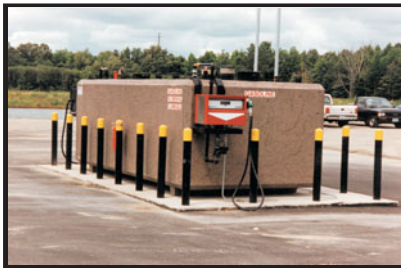
Low Maintenance ConVault

ConVault Aboveground Storage Tanks feature a low maintenance concrete exterior finish that will not rust or corrode. The competition's steel finish requires constant maintenance to protect against corrosion. Over the lifetime of the tank (30 year warranty) ConVault tanks can save owners thousands of dollars in maintenance costs vs. traditional steel jacketed tanks.