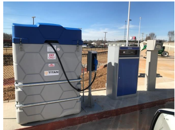
Island Ready Footprint