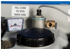
Internal Probe Heater