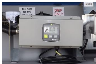
Pulse Meter Option