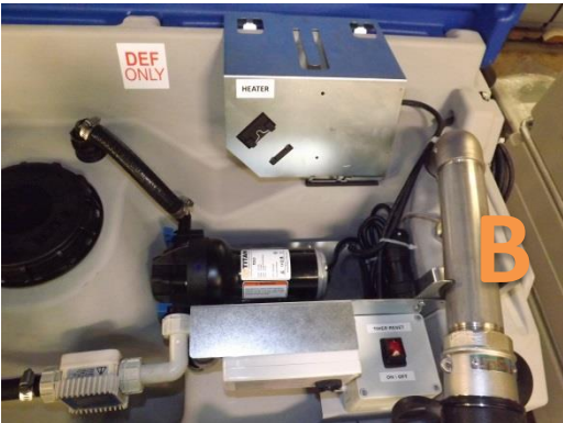
Photo B – The TD10 is equipped with a timer that will automatically shut off the pump after approximately six minutes of run time, or when filling is complete and the nozzle trigger is in the closed position.

Photo A – Assure that the toggle switch is in the “ON” position.