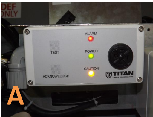
Photo A – When the Cube reaches a level of approximately 85% full, the red alarm light and the yellow caution light on the system display will be illuminated accompanied by an audible warning. This audible alarm is designed to notify the filler that the tank is nearly full.

The audio overfill alarm system is designed to notify personnel filling the Cube when the unit has reached approximately 85% of its fill capacity. It is designed to operate on 110V of power. The green light indicates that the unit is powered and operational.