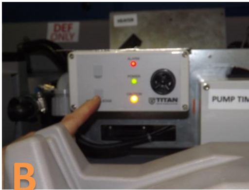
Photo B – To silence the alarm, press the acknowledge button once.

Photo A – When the Cube reaches a level of approximately 85% full, the red alarm light and the yellow caution light on the system display will be illuminated accompanied by an audible warning. This audible alarm is designed to notify the filler that the tank is nearly full.