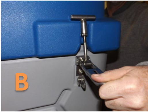
Photo B – Raise the buckle which will release tension on the T handle access latch.

Photo A – Depress the button on the access latch.