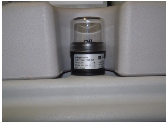
Photo F – To prevent spills, the Cube is constructed with double walls. If a leak within the inner wall were to occur, fluid would be visible in the sight glass. It is recommended that the sight glass be checked on a periodic basis.