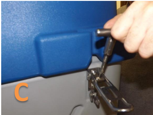
Photo C – Grasp T handle and lower latch 180 degrees. (Repeat process for latch on opposite side.)

Photo B – Raise the buckle which will release tension on the T handle access latch.