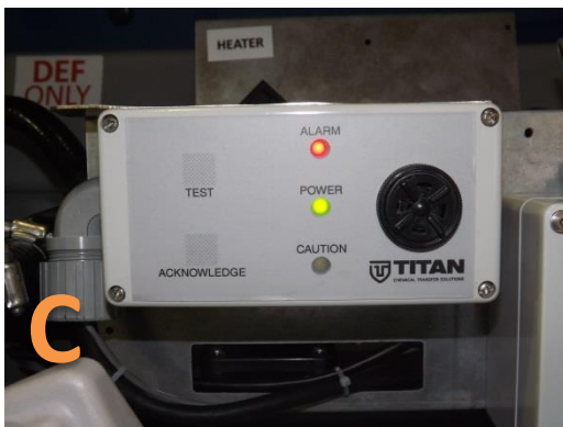
Photo C – Once the alarm has been silenced, the red alarm light will remain lit until the Cube is at less than 85% fill capacity.

Photo B – To silence the alarm, press the acknowledge button once.