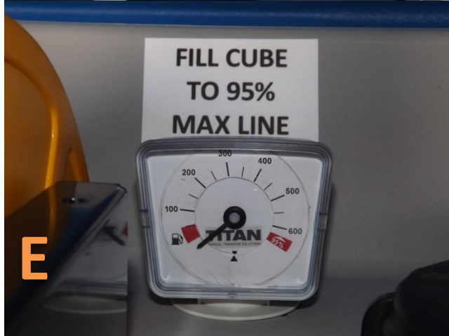
Photo E – After the alarm has been silenced, the person filling the cube should monitor the fill gauge. Dispensing of DEF should stop when the gauge reaches the 95% full mark.

Photo F – To prevent spills, the Cube is constructed with double walls. If a leak within the inner wall were to occur, fluid would be visible in the sight glass. It is recommended that the sight glass be checked on a periodic basis.