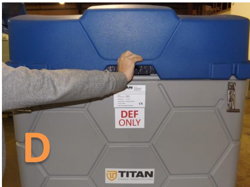
Photo D – With your free hand, slowly let the lid rise. The lid is equipped with two gas spring arms which will control the speed at which the lid will open and, once fully engaged, hold the lid in place.

Photo C – Grasp T handle and lower latch 180 degrees. (Repeat process for latch on opposite side.)